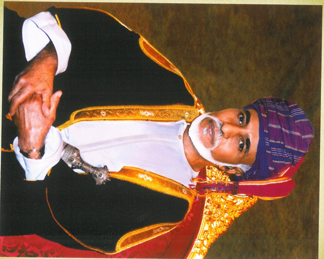
His Majesty Sultan Qaboos Bin Said